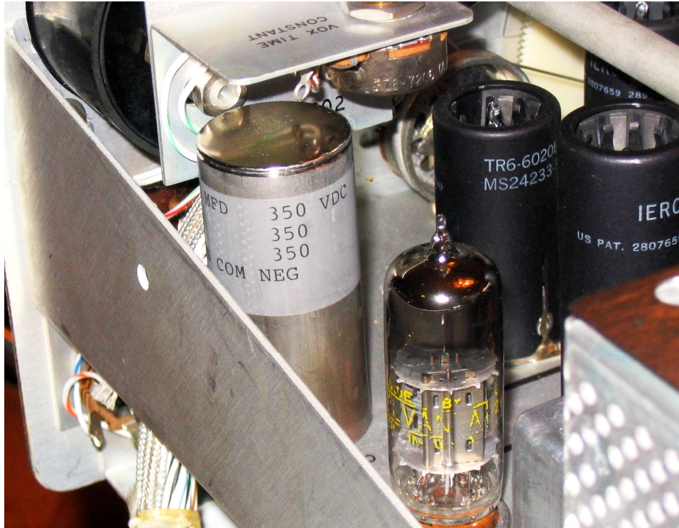
Replacement C106 installed in a KWM-2

One note: Do not use any harsh cleaning material on the plastic label supplied or it will disintegrate. If you have a custom label-maker, or you can supply [or engrave] your own label, it would be wise to include the date of order. I recommended that the date be listed on all labels. Other than that, it was a welcome relief to finally replacing that long overdue component.